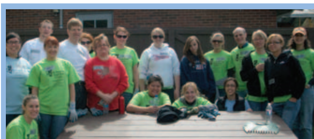
Over 60 Rebuilding Together Seattle volunteers gave the campus a makeover in April by renovating gardens, building a fence, installing new lighting and much more.

We recognize that the volunteers who work with Ryther children and teens are heroic. Connecting can be a slow process, but they go above and beyond to help build healthy relationships. To all of our volunteers, please know that you've brought a sense of belonging to our children, tranquility to our teens and beauty to their surroundings. Many thanks to the organizations that improved our campus: AmeriCorps, UW Beta Theta Pi Fraternity, Microsoft, Rebuilding Together Seattle, Starbucks Coffee Company, UPS, Wabash College, Windermere Real Estate Services and Women's Philanthropic Investment Group (WPIG). In all, there were 435 volunteers in 2010, contributing a combined total of 2,680 hours. We would like to acknowledge our best buddy, cottage and special activities volunteers listed below: